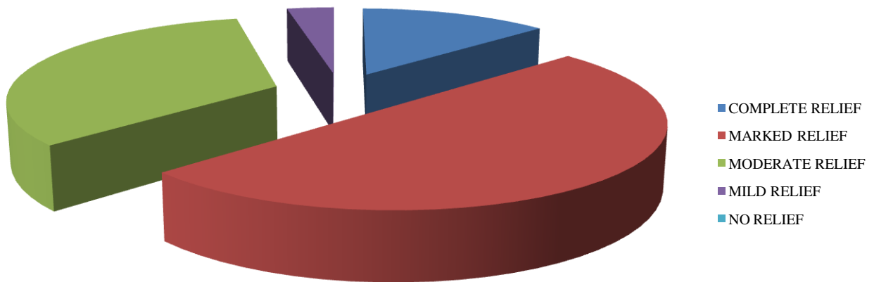
Graph 1: Overall effect of treatment